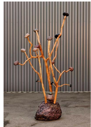
"High Street" by Chicago artist Jeffrey Breslow.