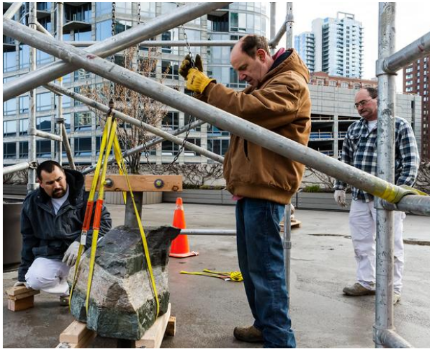
< The 7-foot, one-ton granite and steel sculpture was lifted onto the East Bank Club's sun deck with pulleys and levers.