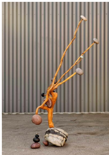
"The Way Forward," a 170 pound maple and granite piece by Chicago artist Jeffrey Breslow.