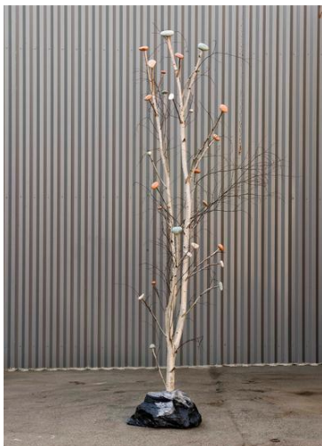
"Long Way Home," a 240-pound sculpture recently installed at a West Loop doctor's office.